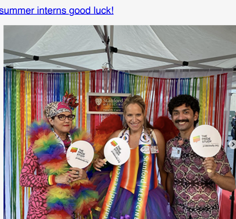
Don't forget to see more stories and images by joining our online community!